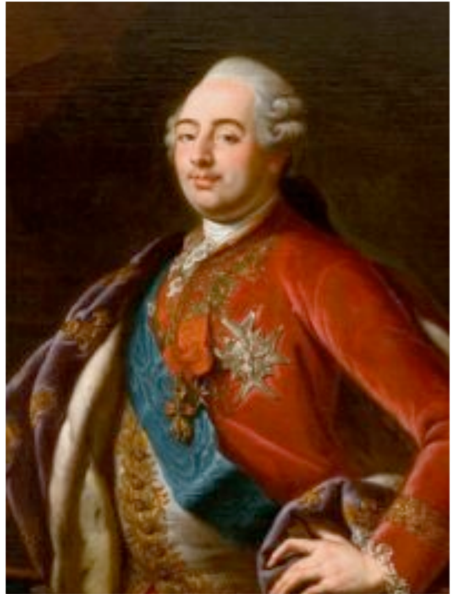
King Louis XVI of France 1754-1793